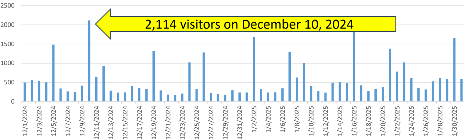
Visitors per Day December1, 2024 – January 31, 2025