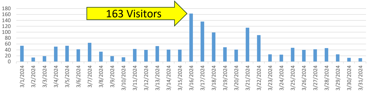
Visitors to CFRS per Day March 1, 2024 - March 31, 2024

A total of 1,551 visitors visited the Campaign Finance Reporting System in March.