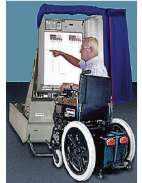
The voting machine adjusts height

The vertical reach of a person in a wheelchair can be extended by turning the wheelchair sideways.