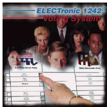
Touch-screen voting is quick and easy.

When you are in the voting booth, you must make at least one selection. Touch the screen next to each candidate or issue you select. You will be instructed on the number of candidates or responses to issues you can select. To change a selection, press the button next to your original choice and the light